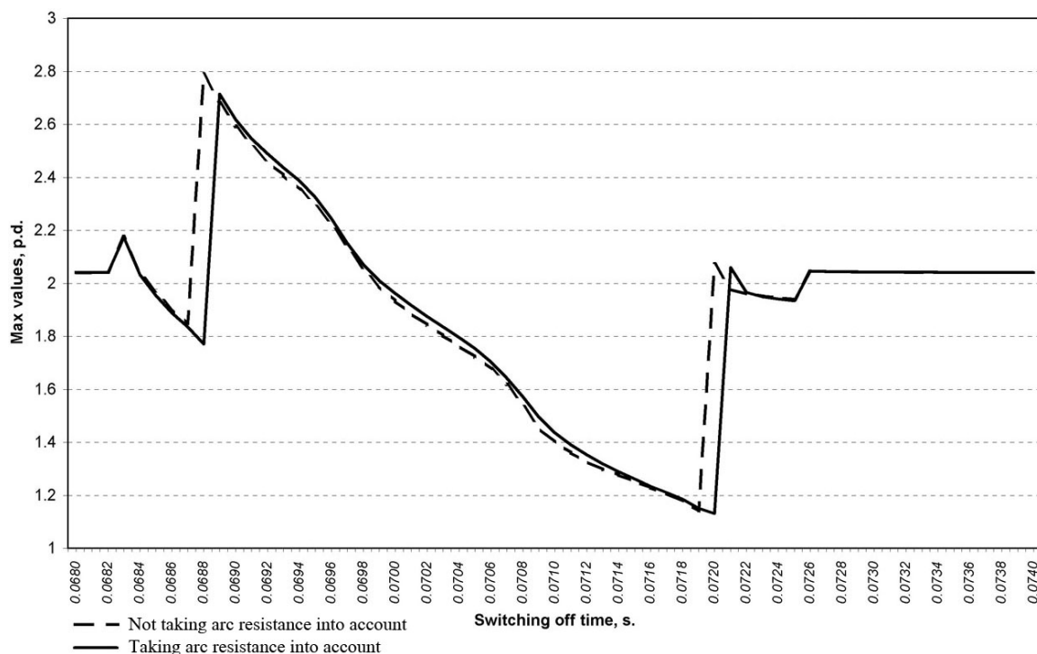
Fig. 3. The dependence of the intercontact potential differences' ratios from the contact separation's beginning time

In the fig. 3 the dependence of the intercontact potential differences' ratios from the contact separation's beginning time is given. The simulations had been carried out for the above shown conditions. This curves show a similarity of the processes occurred but with a certain time difference and of course with different ratios of intercontact voltages while taking and not taking arc resistance into account.