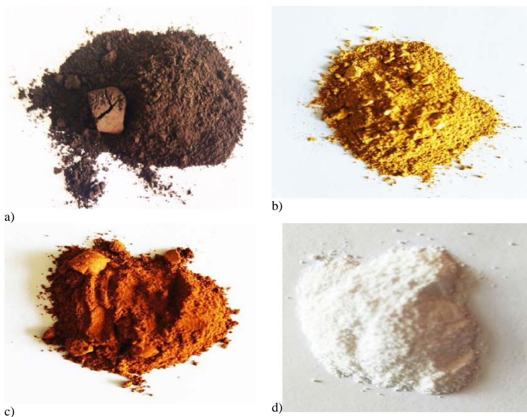
Fig.2. Photographs of a)CuO, b)CuAl 2 O 4 (12% Cu), c)CuAl 2 O 4 (25% Cu) and d)γ-Al 2 O 3 crystals.